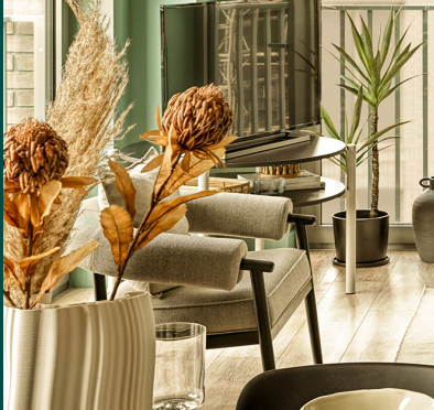
SOFA & COFFEE TABLE