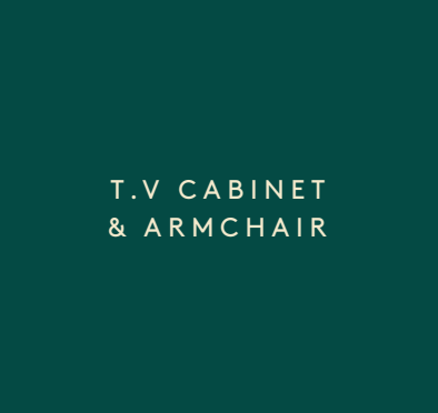
T.V CABINET & ARMCHAIR