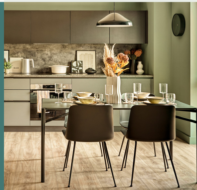
DINING TABLE & CHAIRS