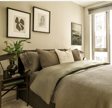
KING-SIZED BED & BEDSIDE TABLE

The bedrooms are fitted with either a king or double size ottoman storage bed and bespoke bedside tables.