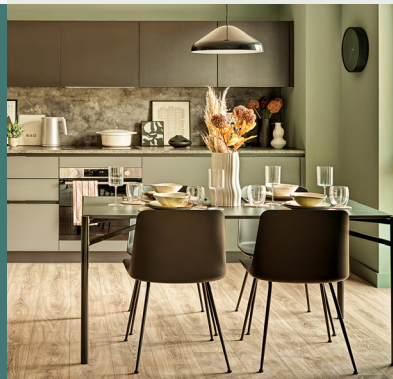
DINING TABLE & CHAIRS