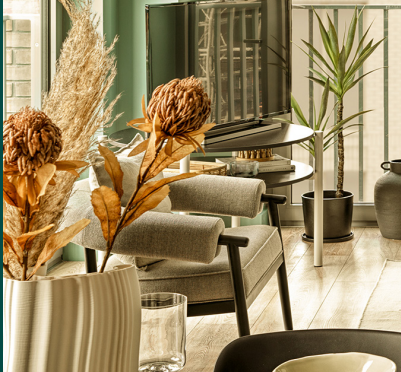
SOFA & COFFEE TABLE