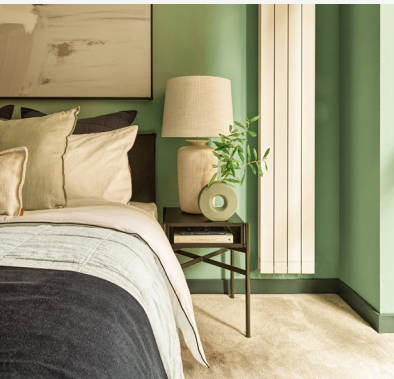
KING-SIZED BED & BEDSIDE TABLE

The bedrooms are fitted with either a king or double size ottoman storage bed and bespoke bedside tables.