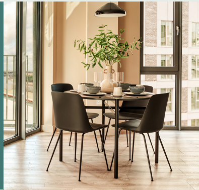
DINING TABLE & CHAIRS