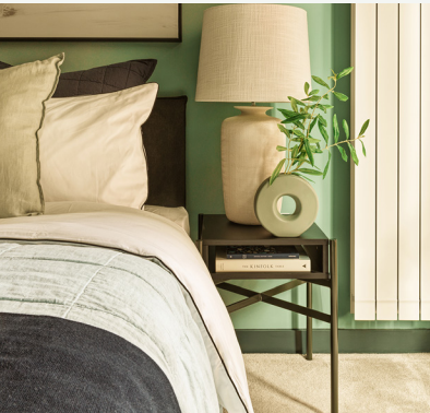
KING-SIZED BED & BEDSIDE TABLE

The bedroom is fitted with a king-sized ottoman storage bed and bespoke bedside tables.